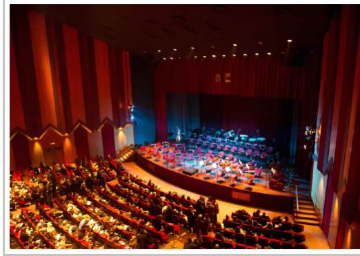
Fig. 0.1: Mohammed V theater

1. Afternoon, Visit of Rabat for participants and accompanying persons.