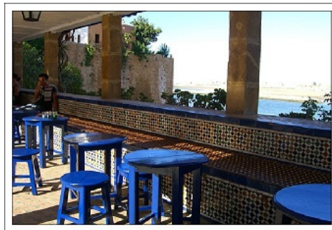
Fig. 0.3: Kasbah Oudayas, (traditional coffee shop)