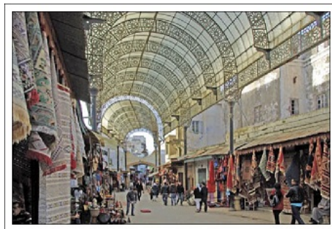
Fig. 0.4: The Andalusian medina

Other places are pleasant to visit like the boating port Marina, located at the mouth of the mythical river Bouregreg, visitors could enjoy various restaurants and coffee shops.