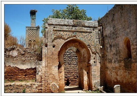
Fig. 0.2: Archaeological site of Chellah

1. Afternoon, Visit of Rabat for participants and accompanying persons.